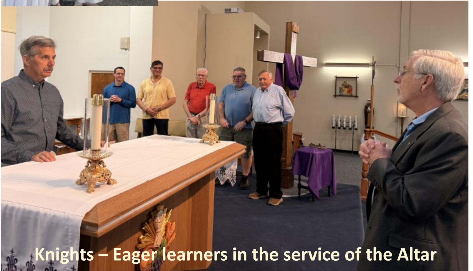
Knights – Eager learners in the service of the Altar