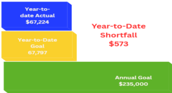
Collections for Church Operations as of April 12, 2026