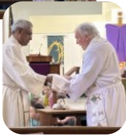
St Francis School Bread Sharing Thursday March 28th - what a special day!