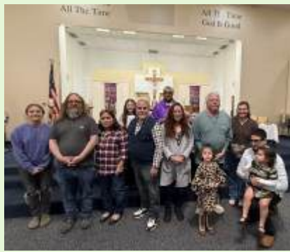
HAPPY MARCH WEDDING ANNIVERSARIES