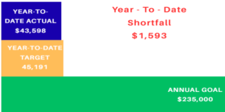
Collections for Church Operations as of March 8, 2026