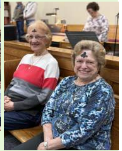
"REMEMBER THAT YOU ARE DUST, AND TO DUST YOU SHALL RETURN"