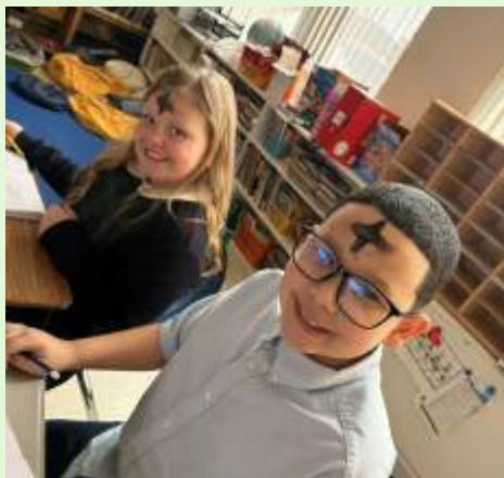
"REPENT AND BELIEVE IN THE GOSPEL"