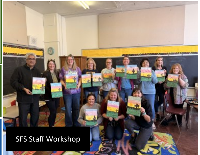
SFS Staff Workshop