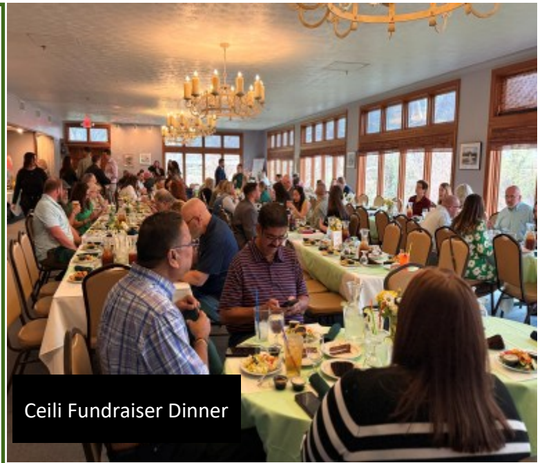
Ceili Fundraiser Dinner