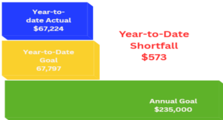
Collections for Church Operations as of April 12, 2026