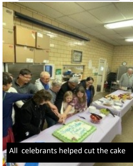
All celebrants helped cut the cake