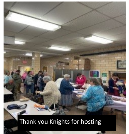
Thank you Knights for hosting